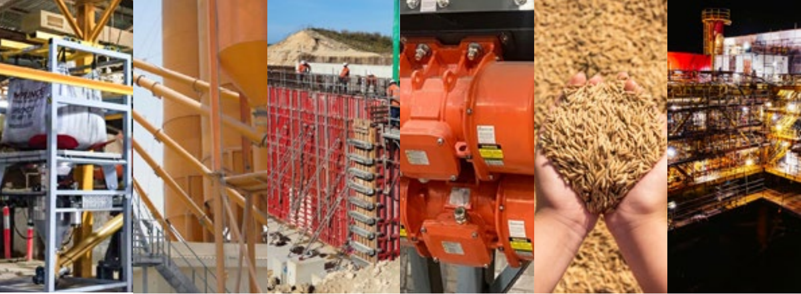
Bag Filling & Discharging